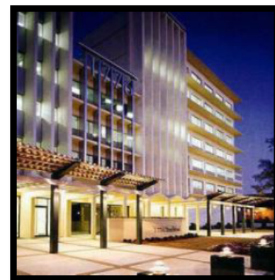
Midtown Atlanta Area 1776 Peachtree Street